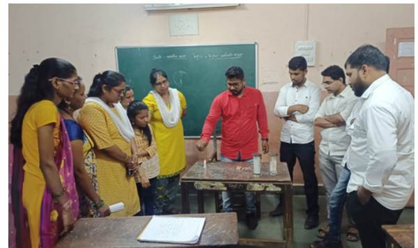
Science Practical Session