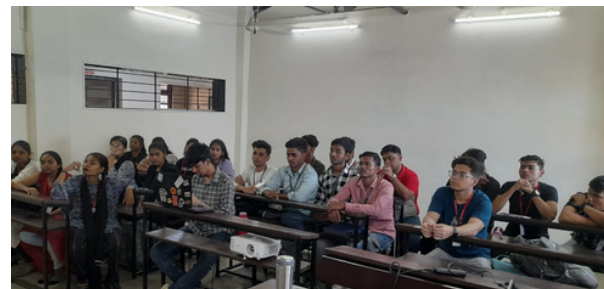
Microfinance Course at GPM College, Mumbai

Tech on Wheels has launched a new microfinance course at GPM College in Mumbai, with the assistance of Dezzal View partner. This collaboration aims to provide students with comprehensive knowledge and skills in the field of microfinance, empowering them to make meaningful contributions to financial inclusion and economic development.