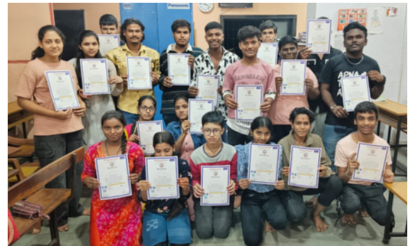
Certificate Distribution at Gandhi Nagar ELC

We conducted a certificate distribution ceremony at four Evening Learning Centers located in Mumbai for the students who completed courses through TOW bus, fostering a sense of accomplishment and encouragement for continued educational pursuits.