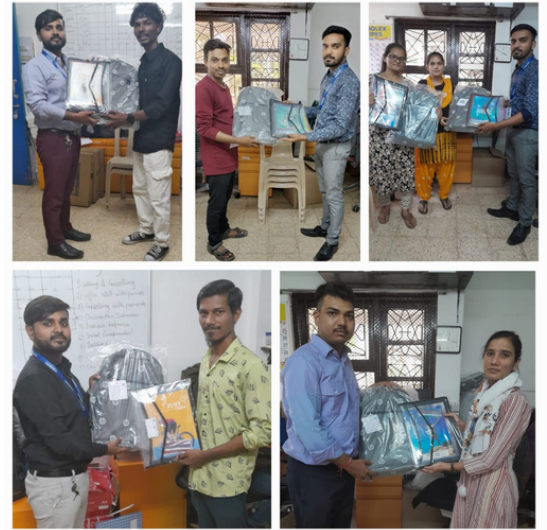
Educational Kit Distribution

Their support goes beyond material assistance, symbolizing hope and empowerment for these students. Their belief in education's transformative power is evident, making a real impact on their lives. We're deeply grateful for their dedication, as their ongoing support helps us empower individuals and build a stronger community.