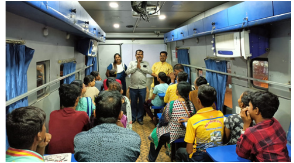
Certificate Distribution at Janta Night School

A Certificate Distribution Ceremony was held at Janta Night School, honoring our dedicated students who completed courses at TOW bus. With the inspiring words of our esteemed headmaster, the event celebrated hard work and dedication.