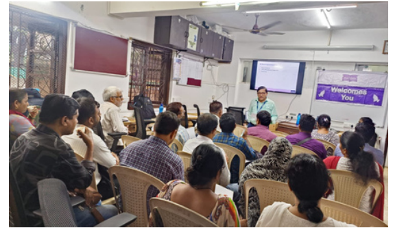
School Leader Meeting