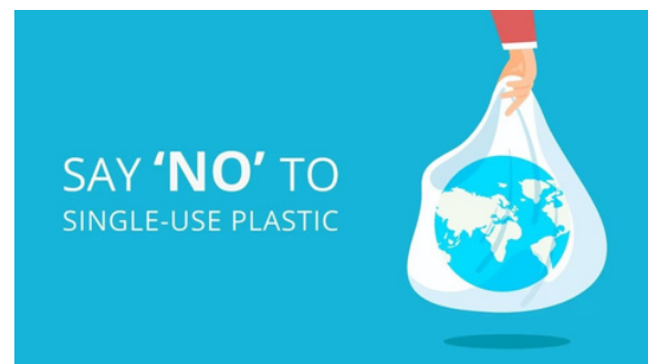
Plastic Free India Campaign

The Plastic Free India Campaign - an initiative aimed at revolutionizing the way we tackle plastic pollution. In this campaign, participants were invited to submit creative solutions towards achieving a plastic-free nation, focusing on innovative, eco-friendly alternatives that are not only efficient but also scalable. From sustainable packaging solutions to biodegradable materials, the goal is to showcase a diverse array of ideas that can lead to a cleaner, greener India. With the outcome set on realizing a Plastic Free India, this campaign provided a platform for individuals to contribute towards a more sustainable future.