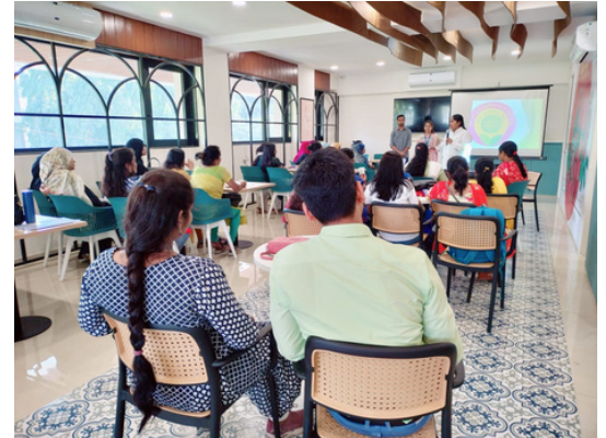
Green Entrepreneurship Workshop