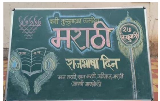
Marathi Rajbhasah Din

We celebrated Marathi Rajbhasha Din at every ELC on February 27th, 2024. The activities were planned by Marathi subject teachers and included various components such as essay writing, highlighting the reasons behind the celebration of Marathi Rajbhasha Din, and delivering speeches by students on the significance of the occasion.