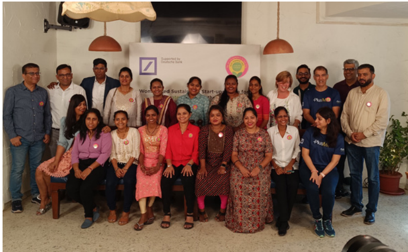
Shark Tank Event

As an outcome, we were able to mobilize 40 female alumni students for this training. Despite this, only 20 were selected, and ultimately, only 12 students successfully completed the business training. These students have been chosen to participate in a Shark Tank event for seed funding support. Among them, seven have been finalized to receive 75% funding donations for their startup ventures.