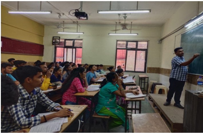
Focus Students Classes at Ghatkopar Center

Focus student classes were conducted for those struggling in mathematics and English, held across 4 centers. Students were divided among centers based on their locality. Expert teachers covered essential topics, providing writing practice and guidance. More than 160 students attended, benefiting from tailored instruction and practice questions. Students are now confident in their ability to pass Mathematics, English, and Science subjects.