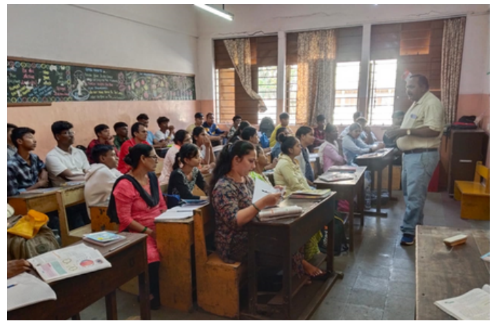
Focus Students Classes at Santacruz Center