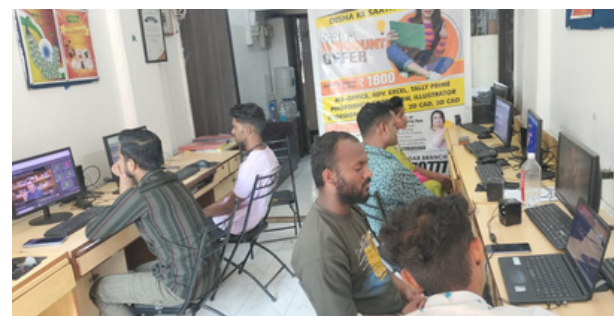
Job Readiness Training