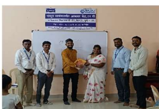
Bajaj Finserv's Visit at Yerwada ELC

During their visit to the Yerwada ELC, representatives from Bajaj Finserv engaged with students and staff, reviewed documentation, and expressed appreciation for Masoom's strong record-keeping and program impact. Their valuable insights and suggestions further strengthened our collaboration, reinforcing their commitment to our mission.