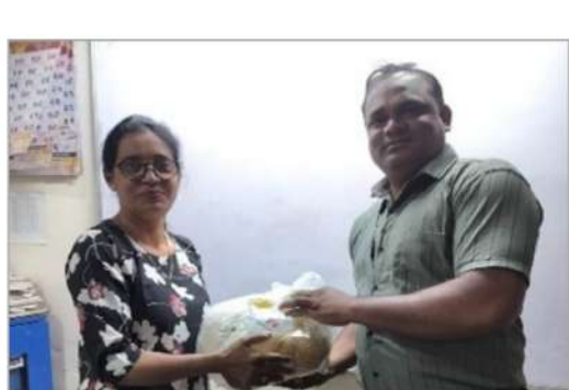
Grocery Distribution by Bajaj Finserv

A heartfelt thank you to Bajaj Finserv for their unwavering support in empowering night school students and fostering inclusive growth.