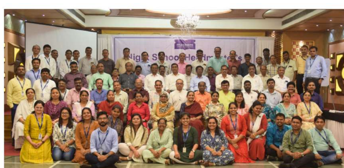
Headmaster's One-Day Workshop, Mumbai