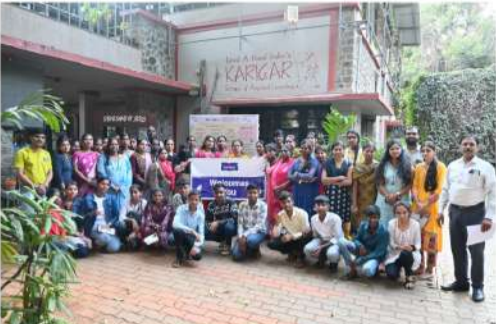
Pune ELCs at Karigar – School of Applied Learning