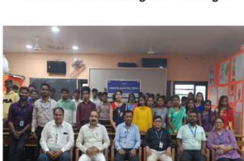
Farewell, Gandhi Nagar ELC, Mumbai

A big thank you to our students, mentors, and donors for being part of this journey. Together, we continue to create meaningful change!