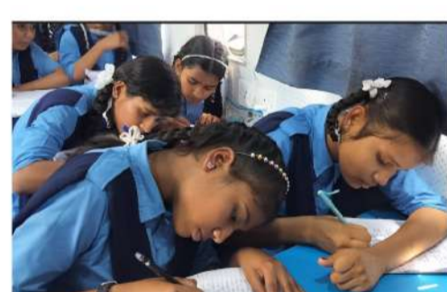
Science Day Activity, Nagpur