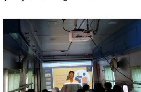
Financial Literacy Session