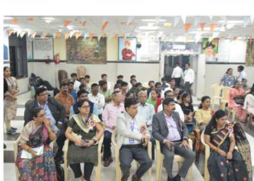
Material Distribution at Kirti Night High School, Sewree, Mumbai