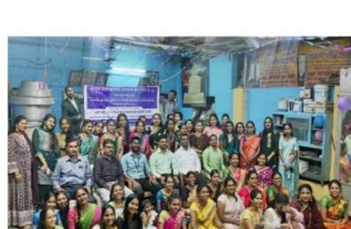
Farewell, Unit No. 22 ELC, Mumbai