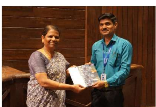
Jyoti Savitri's Children Award Ceremony, Pune

The event featured a book documenting the struggles and successes of the students, with Masoom and other key organizations acknowledged for their support. Masoom remains dedicated to ensuring that education is accessible to everyone, proving that determination can break barriers.