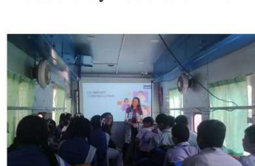
Cyber Security Session

By fostering both digital safety and financial responsibility, these initiatives play a vital role in preparing students for real-world challenges. Masoom remains committed to equipping young minds with the tools they need to thrive in a rapidly evolving world!